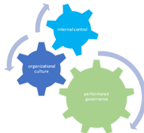
Figure no. 1 - synergy between internal control, organizational culture and performance governance

The objectives outlined establish a clear and focused framework for evaluating managerial and administrative processes within public cultural institutions, emphasizing the direct connection between internal control, organizational culture, and performance governance (Figure no. 1).